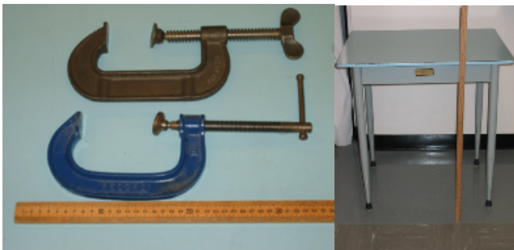
Figure 1: Left: C-Clamps next to a meter stick. Right: Table next to a meter stick.